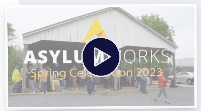
Click to watch a video of the celebration